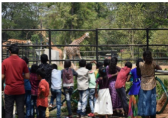
Exposure trip: (From the left) , Picture 1: Children in the Mysore palace, Picture 2: Children at the Mysore zoo

2. Children from class 3, 4 and 5 went for an exposure trip to Mysore on February 13 and 14, 2020.