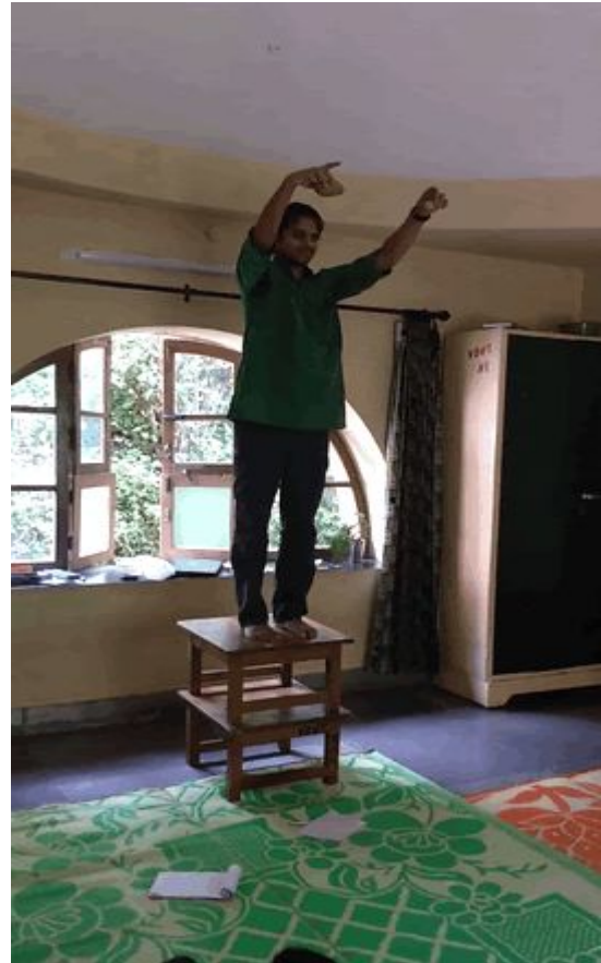
Demonstration to understand gravity.