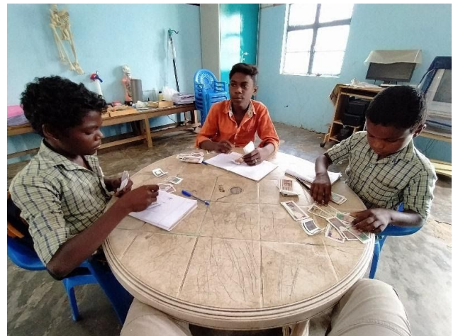
Children counting play money in mind.