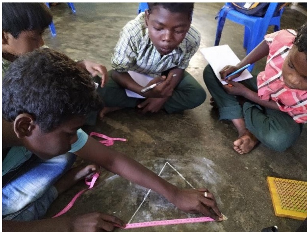
Children finding perimeter using a tape.

As a pilot, GTR, Kanjikolly was chosen and 8 workshops were conducted between January to March 2020.