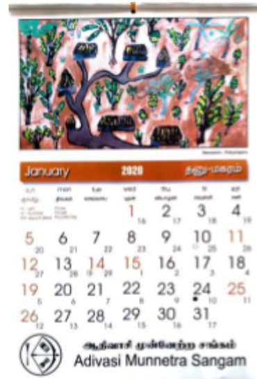
Paintings for the calendar: Picture 1: Children who made the paintings, Picture 2: AMS calendar 2020 with the children's paintings