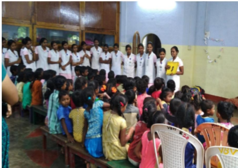
Health check-up: ANM students from the hospital giving a presentation about healthy habits