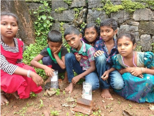
Children with their crude model of Rain Gauge.

Why do things fall down? Do objects of different sizes fall together or take different time?